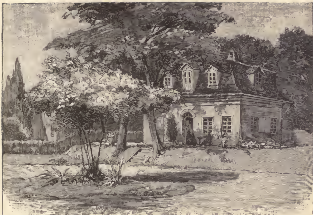
The House in the Garden at Gotha.